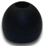
Eartips - 3 Pairs (Small, Medium, Large)