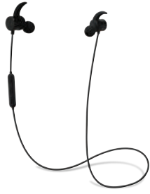
Senso Stereo Bluetooth Wireless Headphones