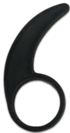
Earhooks - 3 Pairs (Small, Medium, Large)